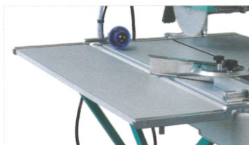
Big cutting capacity